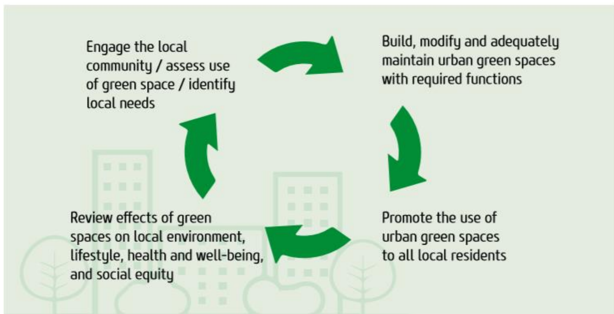
Fig 1: Green Space Action Cycle

by measures to increase the well-being of the population and the recognition of those that take decisions on the future of the urban areas. Sustainable development of cities and development of urban green spaces are very important, since almost half of the country's population now live in urban area. Moreover, there is an urgent need to improve the lifestyles of urban people with a special focus on considering the environmental impact of human activities by raising awareness to the rational use of energy, water and food consumption and natural resources for environmental sustainability. Finally, the role played by green spaces in our urban environments can no longer be ignored by today's policy makers, hence the benefits need to be evaluated to inform future planning and to ensure that existing green spaces are reviewed and adapted to meet the people's need.