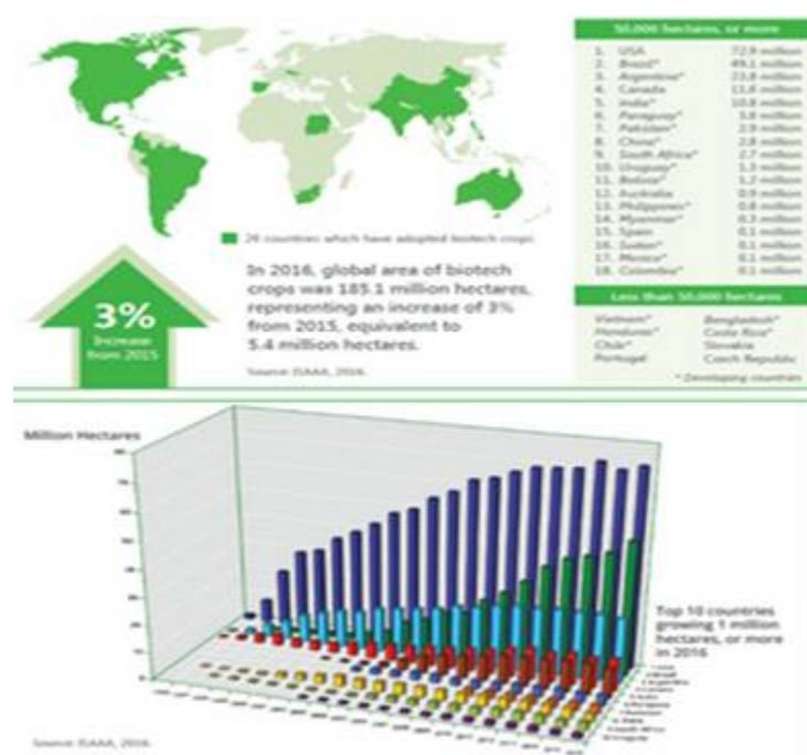
Figure 2: Global Area (Million Hectares) of Biotech Crops, 1996 to 2016, by Country

would have required an increment of 11% of the arable land in the US, or 32% of the cereal area in the EU.