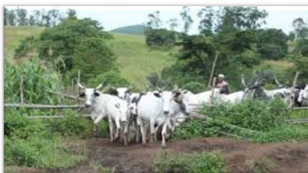
Figure 1. Farmland Attacked by Fulani herdsmen Cow in the Study area, Field Survey Data, 2016.

*Multiple Responses were Recorded; Source: Field Survey Data, 2016