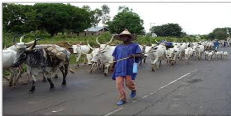
Figure 2. A Fulani herdsman parading cows in the study area, Field Survey Data, 2016.